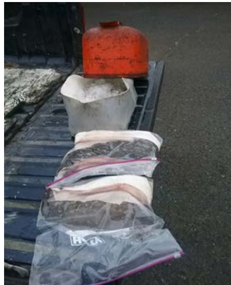
Hidden Halibut Fillets.

revealed the same story about catching the one Halibut and one ling cod this trip and how fishing was a little slow that day. The captain was informed by the Trooper that OSP had received a tip there were occasionally extra fish hidden in this boat. A consent search was requested and the captain stated very casually that he had nothing to hide and that fishing had been slow and to go ahead and search the boat. The Trooper checked the obvious coolers and compartments on the boat and then started searching the gas tank area in the stern of the boat. The Trooper noticed one of the three red marine gas tanks was not plumbed with fuel lines to the outboard motor. The whole top of the red steel tank slid off revealing a big stack of 8 fresh Halibut fillets on ice sitting in a handmade plastic container with a plywood bottom. The captain was ultimately criminally cited for Exceeding the Bag Limit Halibut, Possession of Mutilated Fish, and Fail to Validate Harvest Card . The two crew members were each cited criminally for Aiding/Counseling in a Wildlife Offense . The gas tank and Halibut fillets were seized. The Halibut fillets were donated to the Tillamook County Justice Facility.