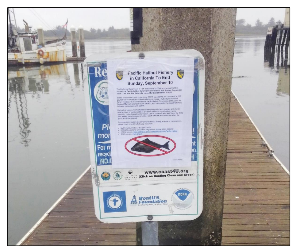
Figure 4. Fishery closure flyer posted at the public launch ramp in Eureka, CA.