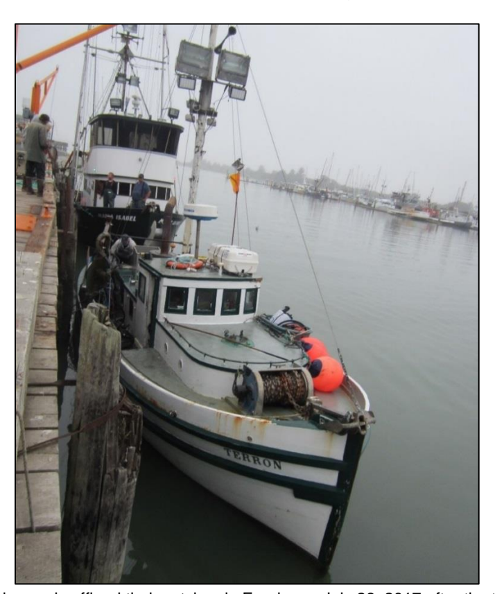
Figure 5. Two commercial vessels offload their catches in Eureka on July 26, 2017 after the third directed commercial fishery opener in Area 2A.

In 2017, five vessels participated across three of the opening days in the 2017 Area 2A directed fishery (Figure 5); the preliminary landings were 3,872 pounds dressed (head on, gutted). The landings were distributed from Crescent City to Eureka and sale of the fish produced an estimated $28,000 in ex-vessel revenue for northern California coastal communities. The 2017 total is a marked increase from commercial landings made in recent prior years, with only catches in 2016 exceeding 1,000 pounds.