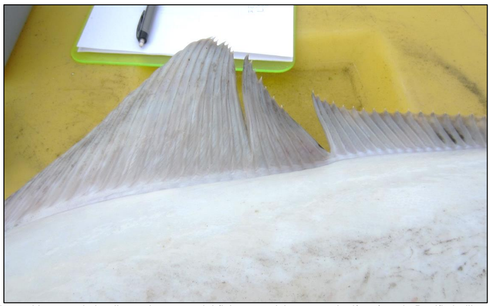
Figure 6. Fin markings made by directed commercial fishery participants to signify a female Pacific halibut caught in the directed commercial fishery off California in July 2017. Two directed commercial fishery participants chose to participate in the IPHC's voluntary sex identification study in the directed commercial fishery in Area 2A in 2017.

CDFW staff were present during the offloading for four vessels in Eureka, and conducted biological sampling per the IPHC's protocols (Figure 6). Ageing structures for Pacific halibut were collected and provided to the IPHC for inclusion in the stock assessment.