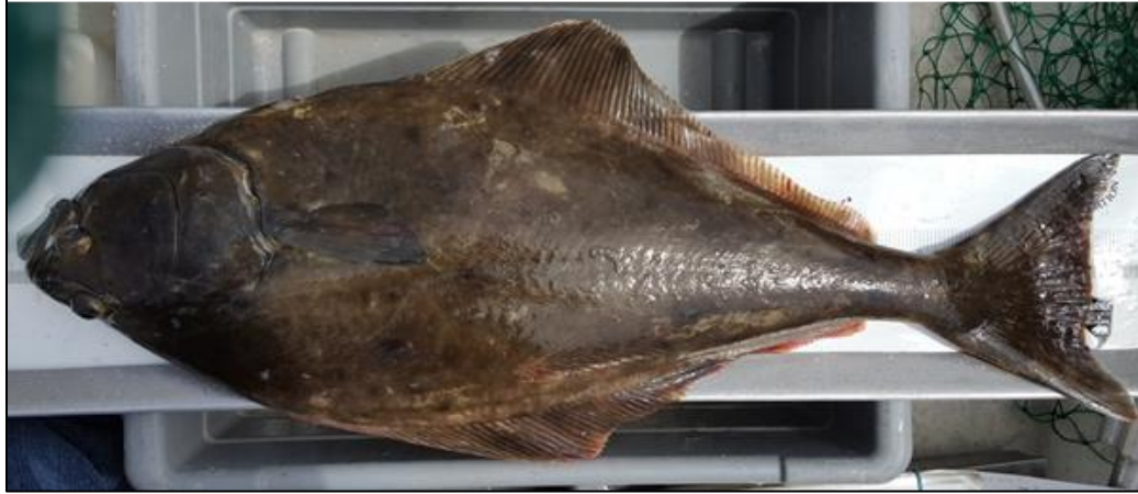
Figure 6. Pacific halibut caught near Santa Cruz, CA on July 3, 2016.

Each year there are several anecdotal reports of large (in excess of 70 pounds) Pacific halibut being caught and or landed in California. Anecdotal information suggests during 2016 anglers began using fishing gear designed to target these larger Pacific halibut, and several anglers had success. In August 2016, an 11 year old caught a 100-pound Pacific halibut out of Shelter Cove