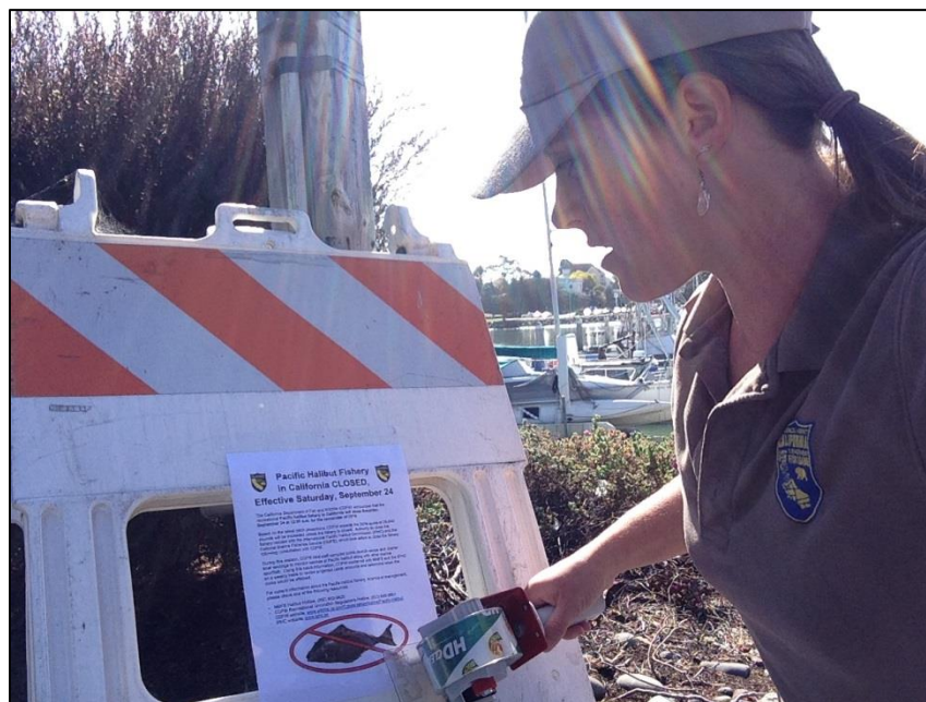
Figure 4. A CDFW CRFS sampler posts the fishery closure flyer in Eureka.

several local north coast news publications; information on its Pacific halibut webpage ( https://www.wildlife.ca.gov/Conservation/Marine/Pacific-Halibut ); CDFW Marine Region blog; CDFW groundfish regulations hotline; and a flyer posted at local harbors (Figure 4), launch ramps, and tackle shops which was also handed out to the public by CRFS samplers (Figure 5). NMFS updated its Pacific halibut hotline with the closure information, and the IPhC posted a news release about the closure to its website. CDFW staff is also aware that a number of local organizations posted the information online or in printed media, and provided notice by marine radio.