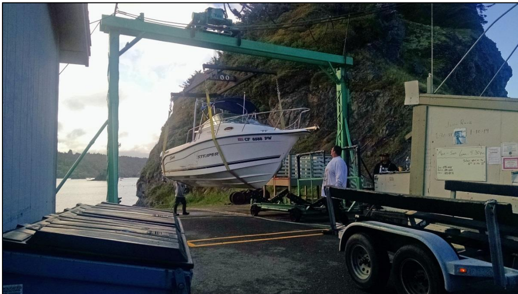
Figure 1. Sport fishing boat using the launch facilities in Trinidad, CA.

A total of 272 Pacific halibut were examined by CRFS samplers throughout the 2016 season. Similar to other years, the greatest number of Pacific halibut observed by samplers (132 fish), were encountered in Trinidad (Figure 1) followed by Eureka and Fields Landing (Figure 2). One Pacific halibut was sampled at the Santa Cruz harbor. The majority of sampled fish (and estimated catch) occurred in August and September.