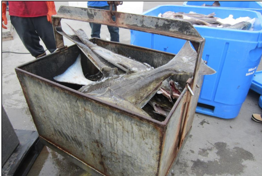
Figure 7. Commercially caught Pacific halibut in Eureka, CA.

For the first time, CDFW staff was present during the offloading for one vessel in Eureka (Figure 7), and conducted biological sampling per the IPHC's protocols. Ageing structures for Pacific halibut were collected and provided to IPCH for inclusion in the stock assessment. CDFW anticipates continuing with future sampling efforts into 2017 if there is sufficient participation in the directed fishery.