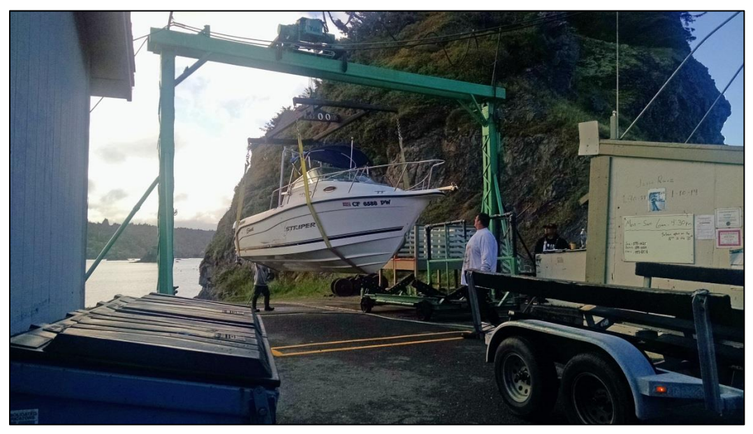
Figure 1. Sport fishing boat using the launch facilities in Trinidad, CA.

A total of 272 Pacific halibut were examined by CRFS samplers throughout the 2016 season. Similar to other years, the greatest number of Pacific halibut observed by samplers (132 fish), were encountered in Trinidad (Figure 1) followed by Eureka and Fields Landing (Figure 2). One Pacific halibut was sampled at the Santa Cruz harbor. The majority of sampled fish (and estimated catch) occurred in August and September.