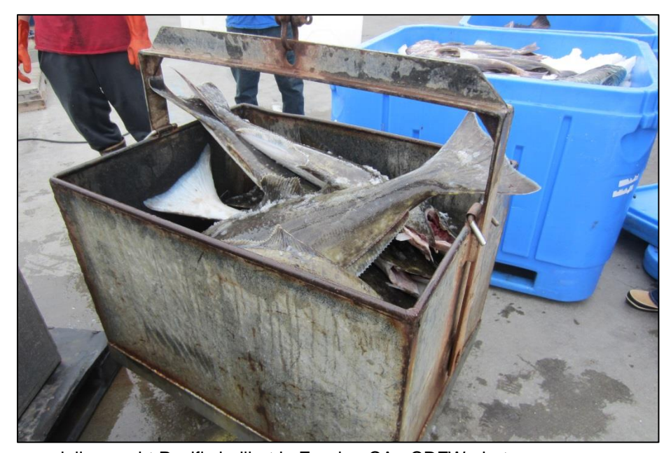
Figure 7. Commercially caught Pacific halibut in Eureka, CA.

For the first time, CDFW staff was present during the offloading for one vessel in Eureka (Figure 7), and conducted biological sampling per the IPHC's protocols. Ageing structures for Pacific halibut were collected and provided to IPCH for inclusion in the stock assessment. CDFW anticipates continuing with future sampling efforts into 2017 if there is sufficient participation in the directed fishery.