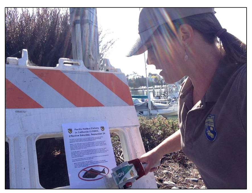
Figure 4. A CDFW CRFS sampler posts the fishery closure flyer in Eureka.

several local north coast news publications; information on its Pacific halibut webpage (<a href="https://www.wildlife.ca.gov/Conservation/Marine/Pacific-Halibut">https://www.wildlife.ca.gov/Conservation/Marine/Pacific-Halibut</a>); CDFW Marine Region blog; CDFW groundfish regulations hotline; and a flyer posted at local harbors (Figure 4), launch ramps, and tackle shops which was also handed out to the public by CRFS samplers (Figure 5). NMFS updated its Pacific halibut hotline with the closure information, and the IPHC posted a news release about the closure to its website. CDFW staff is also aware that a number of local organizations posted the information online or in printed media, and provided notice by marine radio.