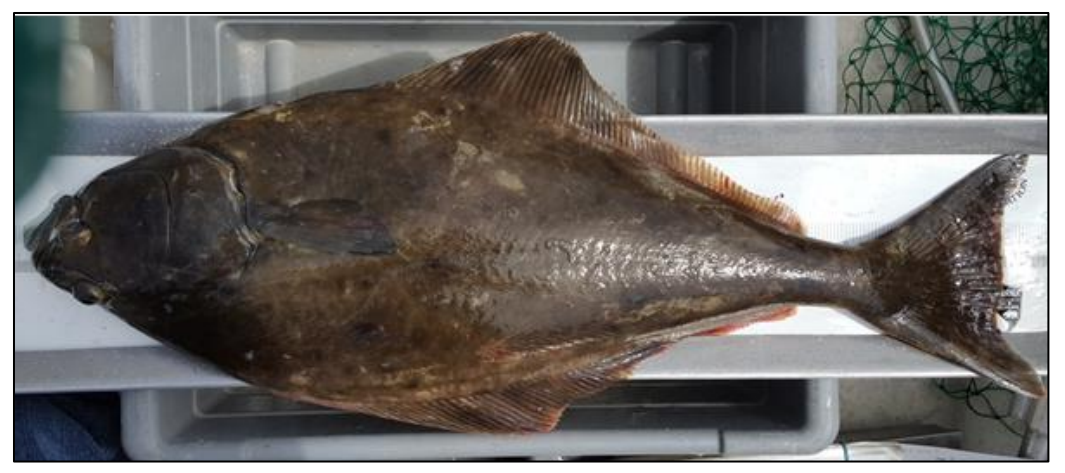
Figure 6. Pacific halibut caught near Santa Cruz, CA on July 3, 2016.

Each year there are several anecdotal reports of large (in excess of 70 pounds) Pacific halibut being caught and or landed in California. Anecdotal information suggests during 2016 anglers began using fishing gear designed to target these larger Pacific halibut, and several anglers had success. In August 2016, an 11 year old caught a 100-pound Pacific halibut out of Shelter Cove