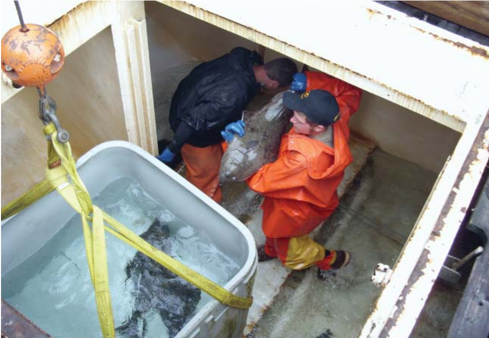
Live halibut are carefully offloaded on their way to a research tank in Newport, OR.

The experimental design called for six experimental treatment groups plus a control group. On November 4 and 5, fish used in these treatments were either surgically implanted with tags or had tags affixed to them externally. The design left two individuals untagged. Two fish from the smallest size category were omitted.