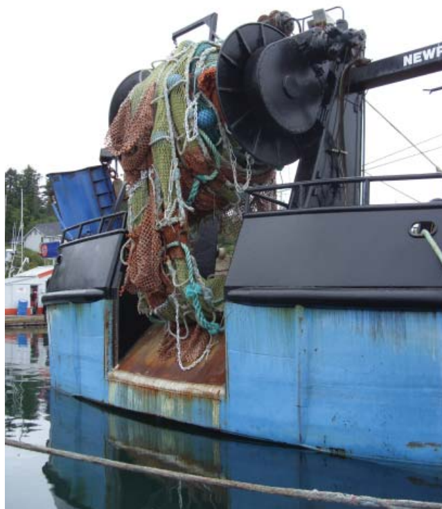
The stern of a trawl fishing vessel.

For Area 2B, trawl fishery bycatch mortality was estimated at 220,000 pounds, an increase of 50% from 2008 but still below the average of 250,000 pounds for the 2000–2009 period. This past year saw a return to