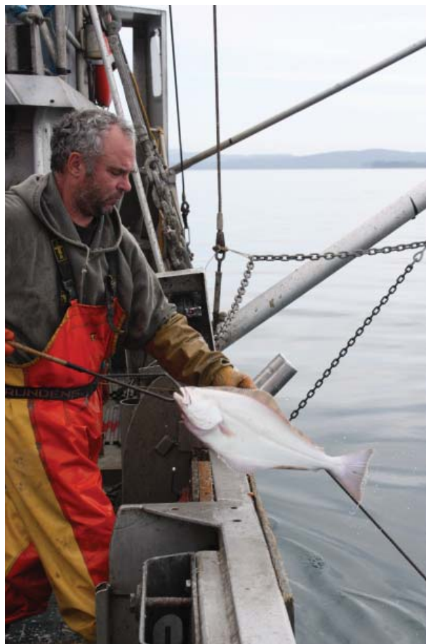
A small halibut is pulled aboard the F/V Bold Pursuit during the stock assessment survey.

Stated succinctly, the Commission's policy is to harvest 20% of the coastwide exploitable biomass when the spawning biomass is estimated to be above 30% of a level defined as the unfished level .