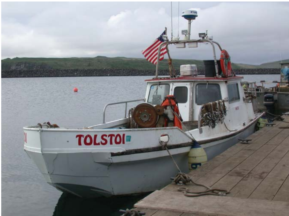
The F/V Tolstoi tied to the dock in St. Paul, AK.

The first halibut fishery was conducted by aboriginal people for the purpose of survival. When European Americans industrialized the halibut fishery in the late 1800s, very little in the way of knowledge of the original fisheries was preserved. There was no history of catch statistics nor history of regulatory actions that transferred into the new management system. Although the aboriginal fisheries had been governed by customs and traditions, these were generally not understood by the new managers. However, elaborate and