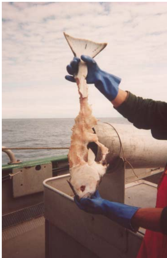
This fish has been chewed on, most likely by dogfish, and cannot be commercially harvested.

The IPHC also accounts for halibut lost during the halibut fishery.