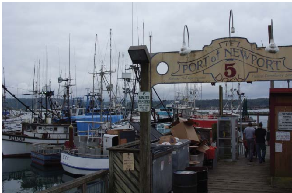
The port of Newport, OR is a hub of activity in the summer months.