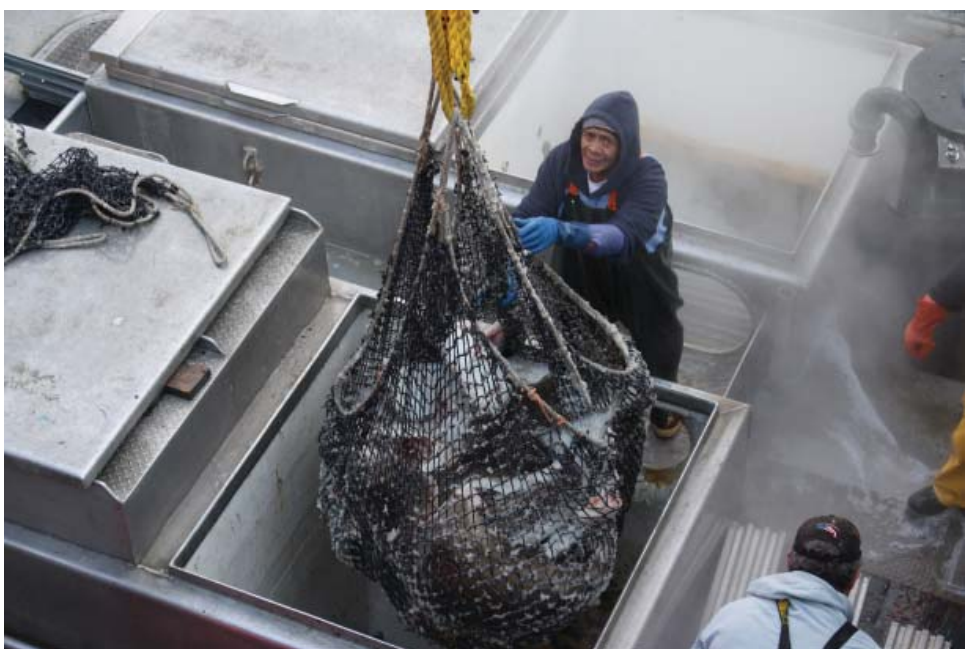
The F/V Bold Pursuit offloads the halibut catch.

How far halibut go and when they move among areas is a current topic of investigation at the IPHC.