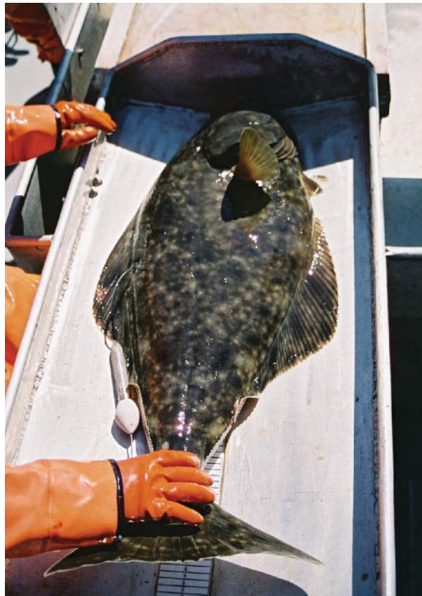
This halibut has been tagged with a PAT tag and is ready for release.

Some of the tags prematurely release from the halibut, but still provide valuable information.