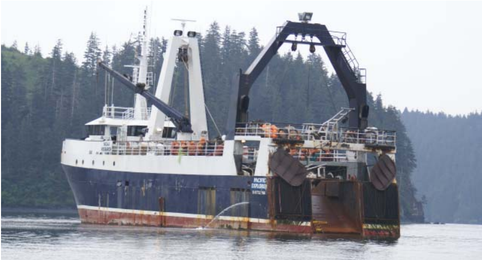
F/V Pacific Explorer.

primarily on distribution and abundance estimates from prior surveys and the relative commercial value of the major groundfish species. All three vessels started sampling at the western end of the survey area and proceeded eastward.