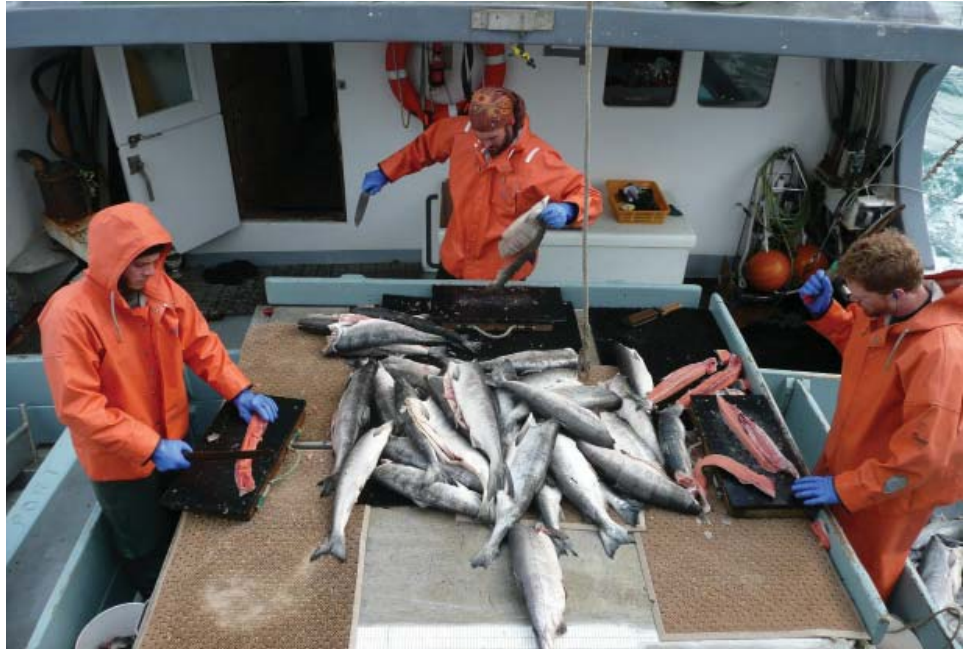
Deckhands chop bait aboard the F/V Waterfall during the stock assessment survey.

Generally speaking, in recent years average age of males has been higher and average length smaller than for females.