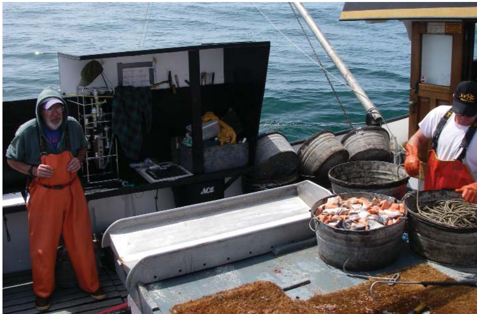
IPHC sea sampler, Richard Bruce, waits for the next set while a crewman baits gear aboard the F/V Blackhawk during the IPHC stock assessment survey.

In the 1960s the Commission started surveying the waters independently of the commercial fishery in order to develop a more focused base of information about the halibut population in the ocean. The Commission has changed the design of the survey several times over the years, but the basic structure has remained the same. Operationally, the survey vessels fish 3 or 4 predetermined locations each day. The captured halibut are measured, classified by sex and gonad maturity, and otolith samples are collected and used to estimate the age distribution of the population. This survey collects many kinds of important information, but one of the most important products of the survey is a measure of the catch per unit of effort, as recommended by the Commission's first biologists in the 1930s. By combining information from shoreside commercial catch sampling with the information from the Commission's survey, managers have the information they need to develop a clear picture of the status of the stock, the trends in abundance, and the effects of fishing.