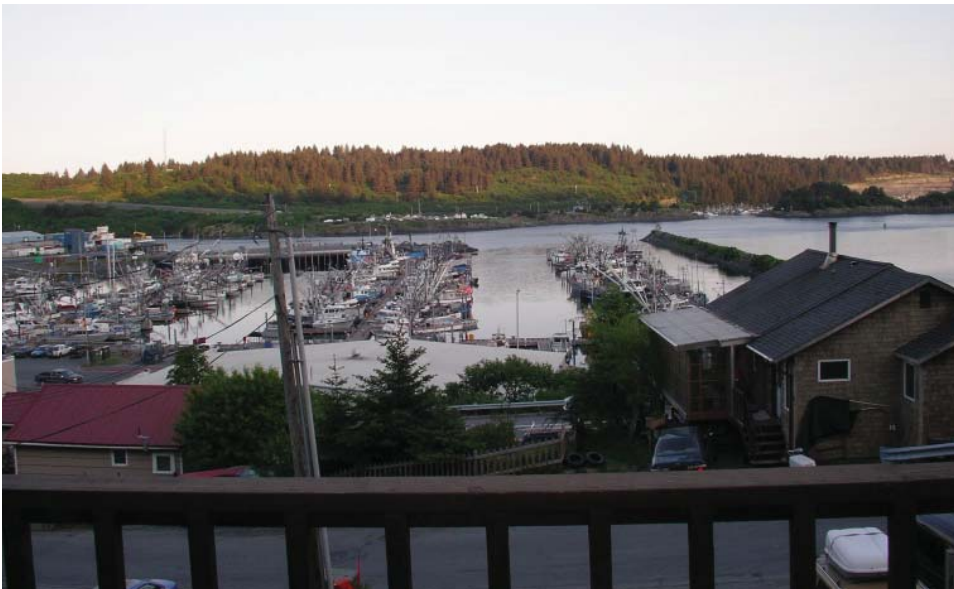
A peaceful day in Kodiak, AK.

The sport fishery harvest in Area 3A also declined in 2009, driven solely by a decrease in the charter fishery harvest. The charter fishery in Area 3A is also heavily dependent on tourism but less than the 2C fishery. In any case, the bag limit remained unchanged at two fish per day, so the decline is quite likely due to a depressed economy and the resulting loss of the angler's ability to pay to go out on charter vessels. The average size of fish landed was relatively unchanged from 2008 for both the charter and private sectors.