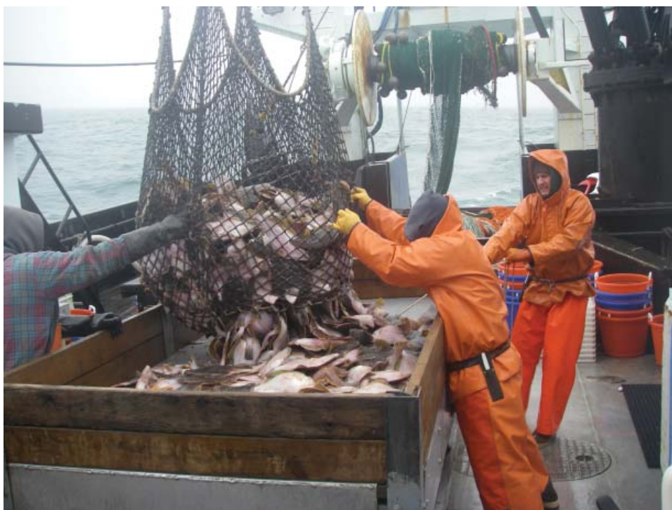
Bycatch is taken by all gear types including trawl, longline, and pot.

Bycatch of unwanted species has inspired ongoing controversy, and halibut caught incidentally is no different.