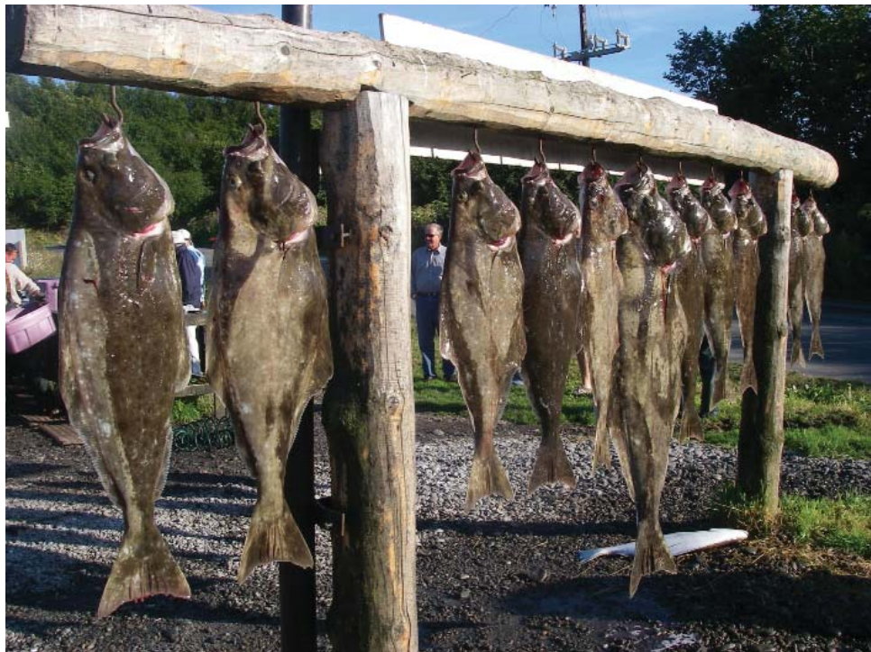
The day's catch is displayed for all to see in Ninilchik, AK.

Although sport fishing for halibut may have some of its origins with the contemplative, solitary European with a hook and pole, obviously fishing in marine waters for a potentially very large fish is in many ways different. Sport fishing for halibut usually involves fishing from some kind of a vessel. For that reason, sport fishing for halibut involves some commercial aspects. For example, many small businesses offer charters for individuals that would otherwise not have the means to reach the halibut fishing grounds. Similarly, many businesses