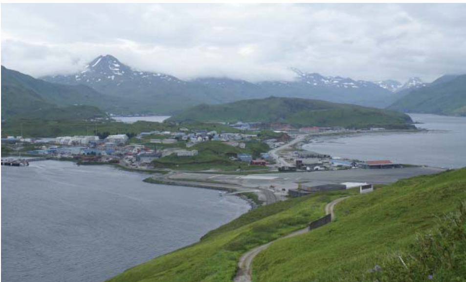
The trawl survey begins in Dutch Harbor, AK, shown here from Mt. Ballyhoo.

The NMFS trawl surveys are a way for IPHC scientists to get a glimpse of the younger and smaller cohorts of halibut before they've reached commercial size.