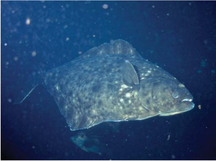
Live halibut.

halibut which suggests different mechanisms for sex determination in the two species. Additional comparisons between Atlantic and Pacific halibut based on mitochondrial DNA sequence generally show higher gene diversity in Pacific halibut, indicating a signature of differing demographic histories. Finally, 36 EST-based