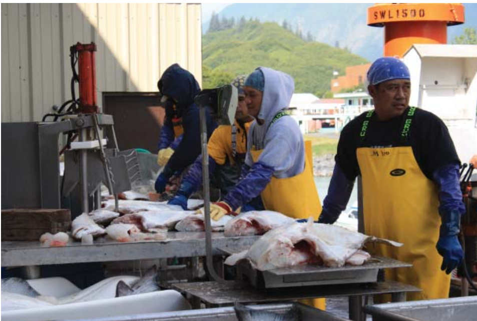
Plant workers process the catch from the F/V Bold Pursuit .

Homer was at the top of the list for most pounds landed followed by Kodiak and Seward.