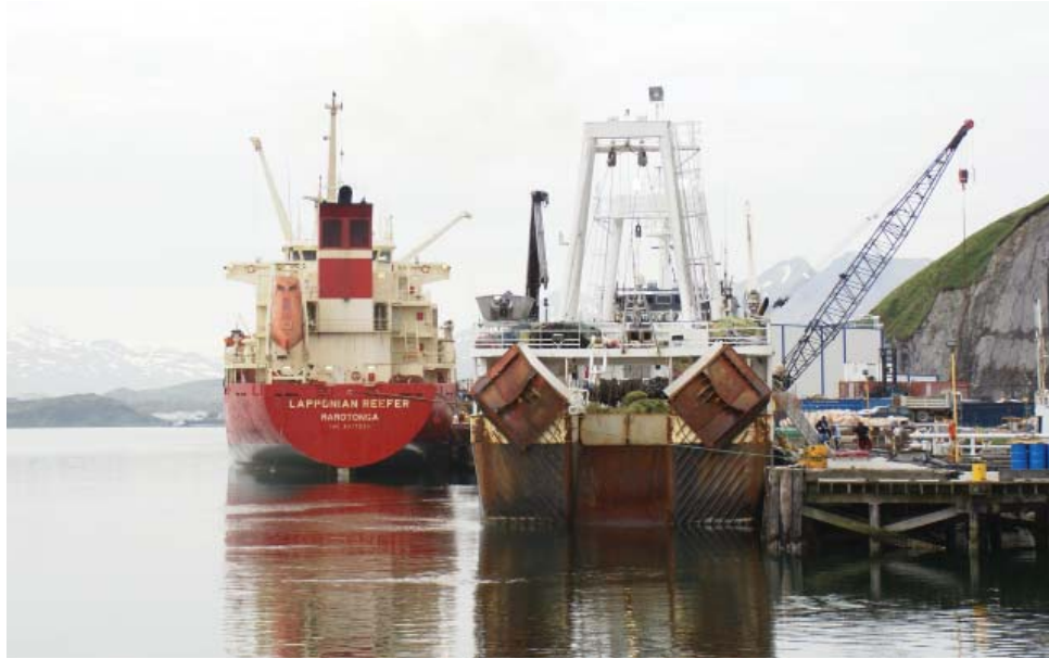
Vessels tied to the dock in Dutch Harbor, AK.

Alyeska, Unisea, SeaFreeze, Coastal Transportation, Food Lifeline, and Seashare all worked together to provide 16,000 pounds of halibut to food banks in 2009.